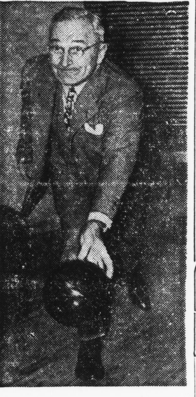
Harry S. Truman, the Missouri southpaw, inaugurated the newly-installed bowling alleys in the basement of the White House and threw the first ball with his left arm. The alleys were installed as a birthday gift to the President.