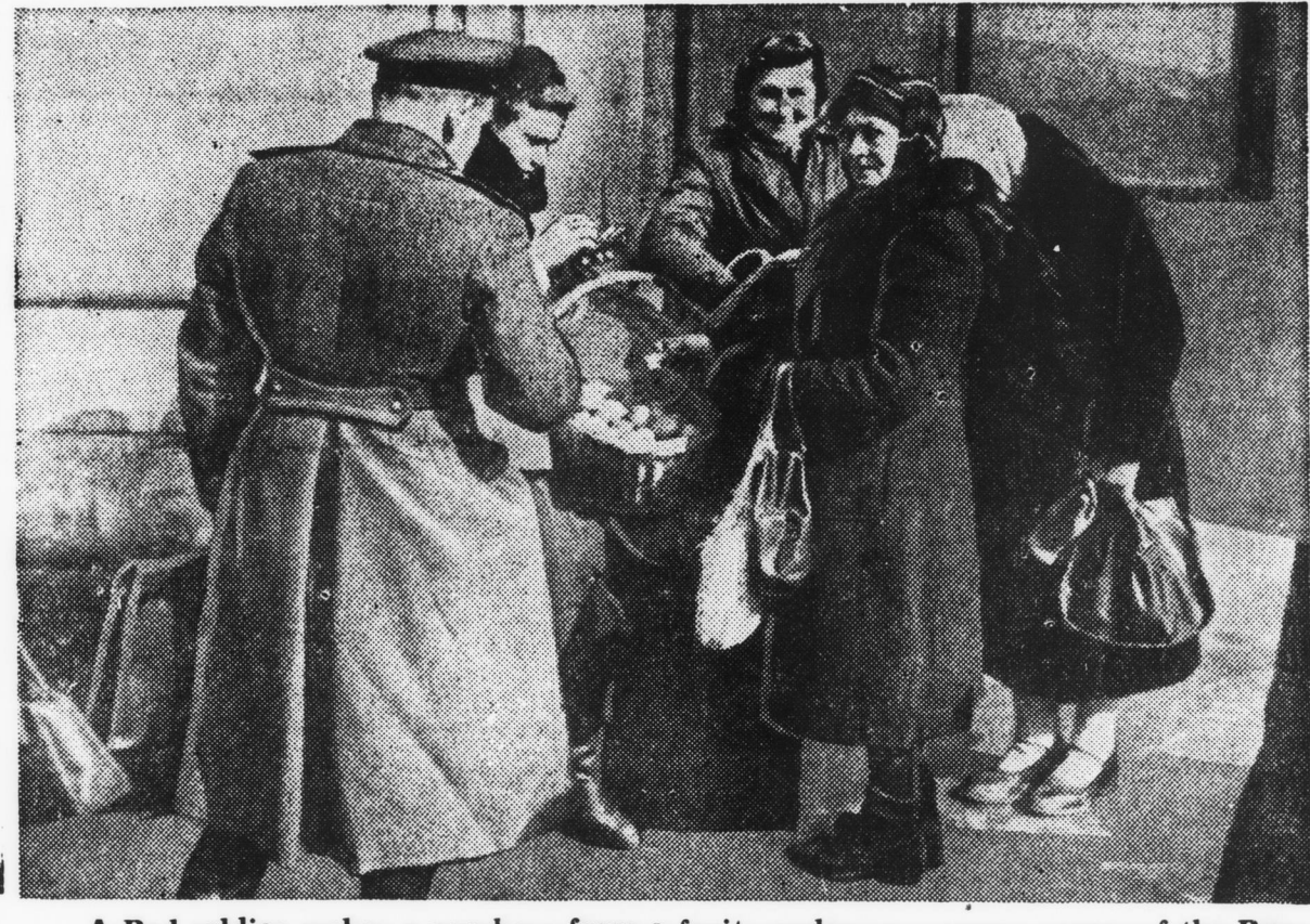
A Red soldier makes a purchase from a fruit vendor on a sunny corner of the Russian capital. With the coming of Spring Soviet citizens, despite a 15 degree temperature, come out of their cramped quarters for a welcoming breath of fresh air and sunshine.