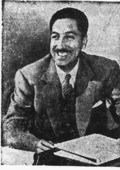
PRESIDENT MIGUEL ALAMAN gave a report to the people of Mexico on his recent trip to the United States when he got a loan for Mexican development.