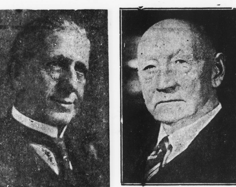
Senator Clyde R. Hoey, left and Congressman R. L. Doughton, right strongly in favor of restoring appropriation for agriculture and continuing program.