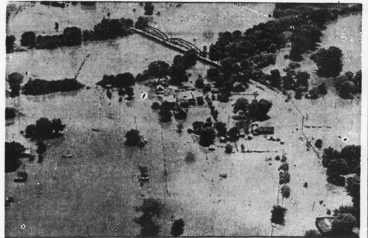
The town shown above, Red Rock, Ia., is in the Des Moines river valley, the center of Iowa's worst flood in history, in which many lost their lives and untold damage resulted to farm land and towns. The same story held in other states where high water flooded valuable farm land.