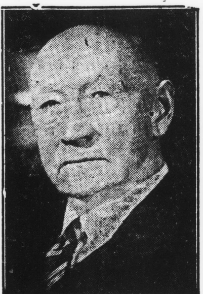
Congressman R. L. Doughton