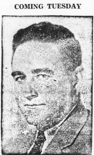
W. Kerr Scott, N. C. Commissioner of Agriculture, who will be here, Tuesday, for the tobacco field day program at the Upper Mt. Test Farm at Transou.