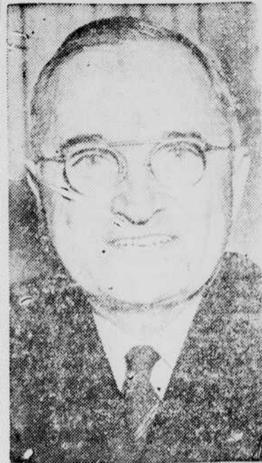
President Harry Truman, who points out that newspapers have played a splendid part in freedom's cause