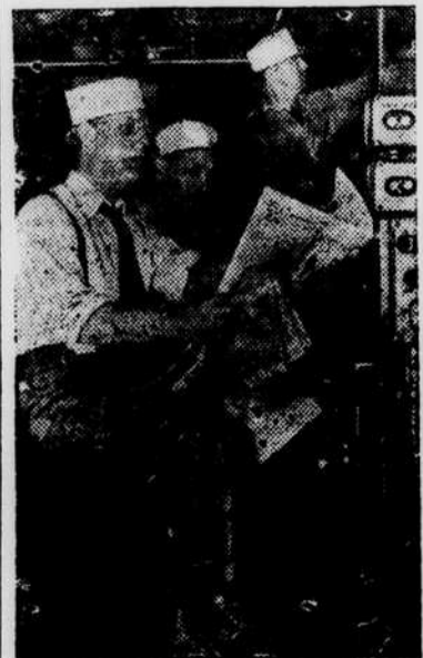
Former newsboy Kay Kyser, now famed as the O! Professor, helps pressmen check an edition of the New York Herald Tribune during a visit in honor of National Newspaper Week, October 1 to 8.

Being a high class student myself, ever since I rocked Rocky Mount by winning the zinc-plated yo-yo for being best orator in the drum and bugle, chowder and peanut racing corps, I remember when Shakespeare referred to the seven ages of man. Now we can do that through (Continued on page 8)