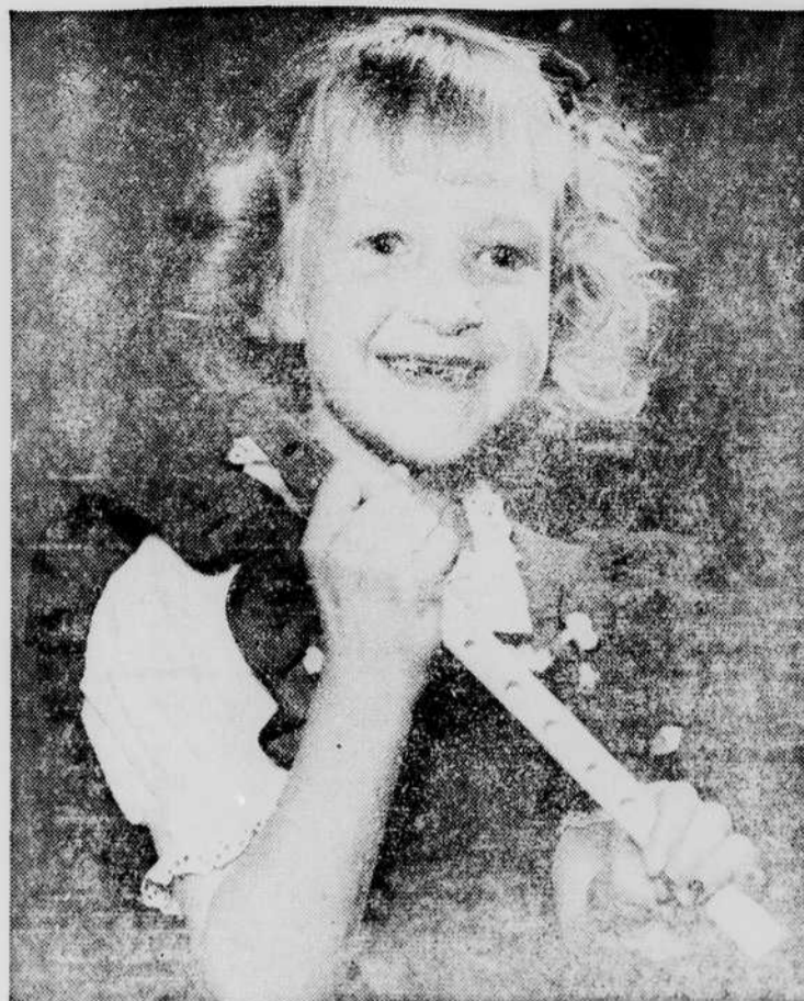
To play a merry tune teaches breath control to this youngster, who is having speech therapy. Speech therapy is a basic service to the handicapped in education, in community living, and in job placement. It is only one of the many services made possible to crippled children by your purchase of Easter Seals under the sponsorship of the Jeffersons Rotary Club.