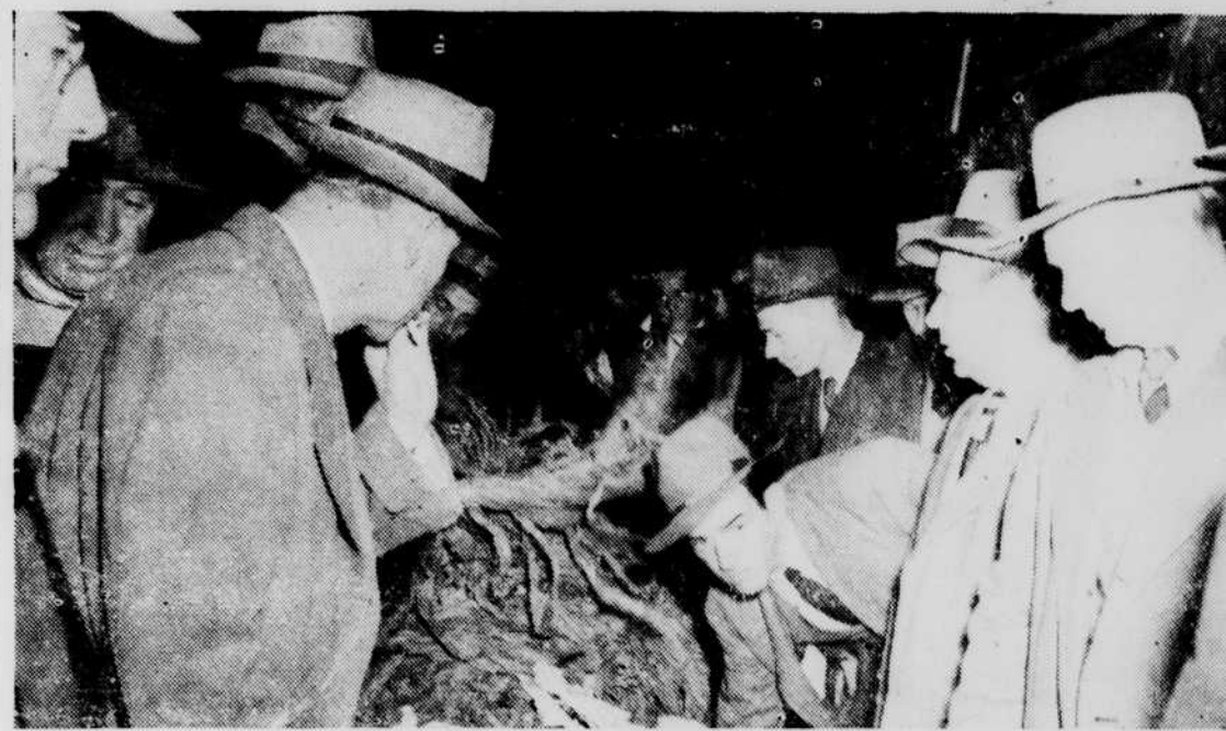
Buyers examine the leaf as sales go on. Farmers and others follow with interest the sales at the Tri-State Burley Warehouse where records are being set for high prices on good tobacco.