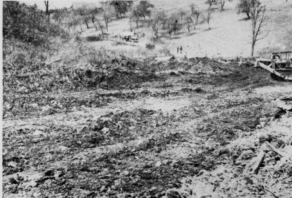
A section of the rural improvement road work in the Burnt Hill section, which was started last month is expected to be completed soon. The section of this road under construction is being re-graded and widened.