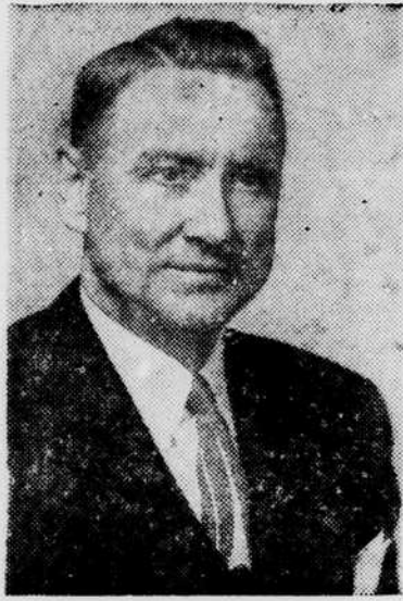
Willis Smith, who won the Democratic nomination for U. S. Senate on Saturday.