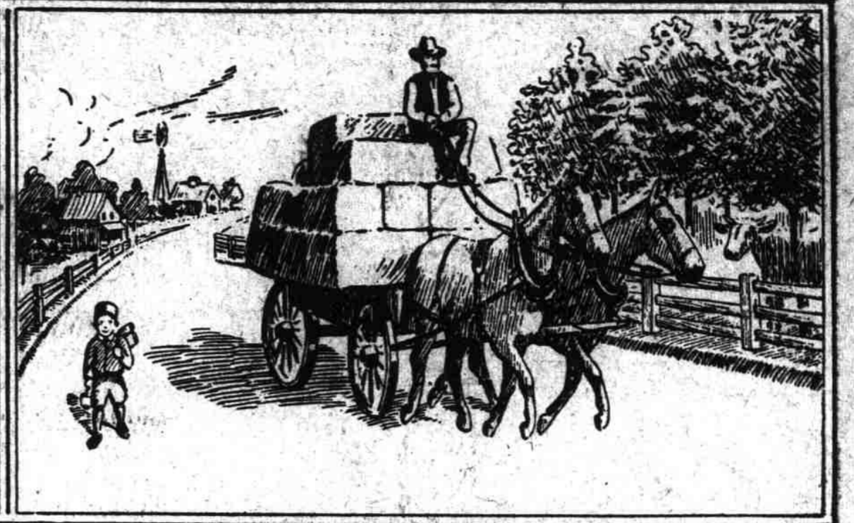
"I'LL BE BACK IN AN HOUR"

we have this to say: We have made our fight in the open, we have endeavored to avoid any personalities, we have sought to advance the cause of GOOD ROADS in the County. We have not presumed to impose upon the intelligence of the people of Person County by "Muddying the water." Our campaign has been one effort to put this proposition before the voters as a business matter. If defeated in the present fight we will keep up the fight for GOOD ROADS. The County needs them and we mean to keep on fighting until the County gets them. No man or any set of men can put themselves against the progress of our County and expect the future to vindicate their action. In this fight for better roads, he is said to the everlasting credit of the town of ROXBORO, that while it pays over ONE FOURTH of the entire road tax, and while not one cent of the bond issue can be spent in its limits, yet, for the good of person County, its citizens are willing to be taxed. Does this have the appearance of a selfish motive?