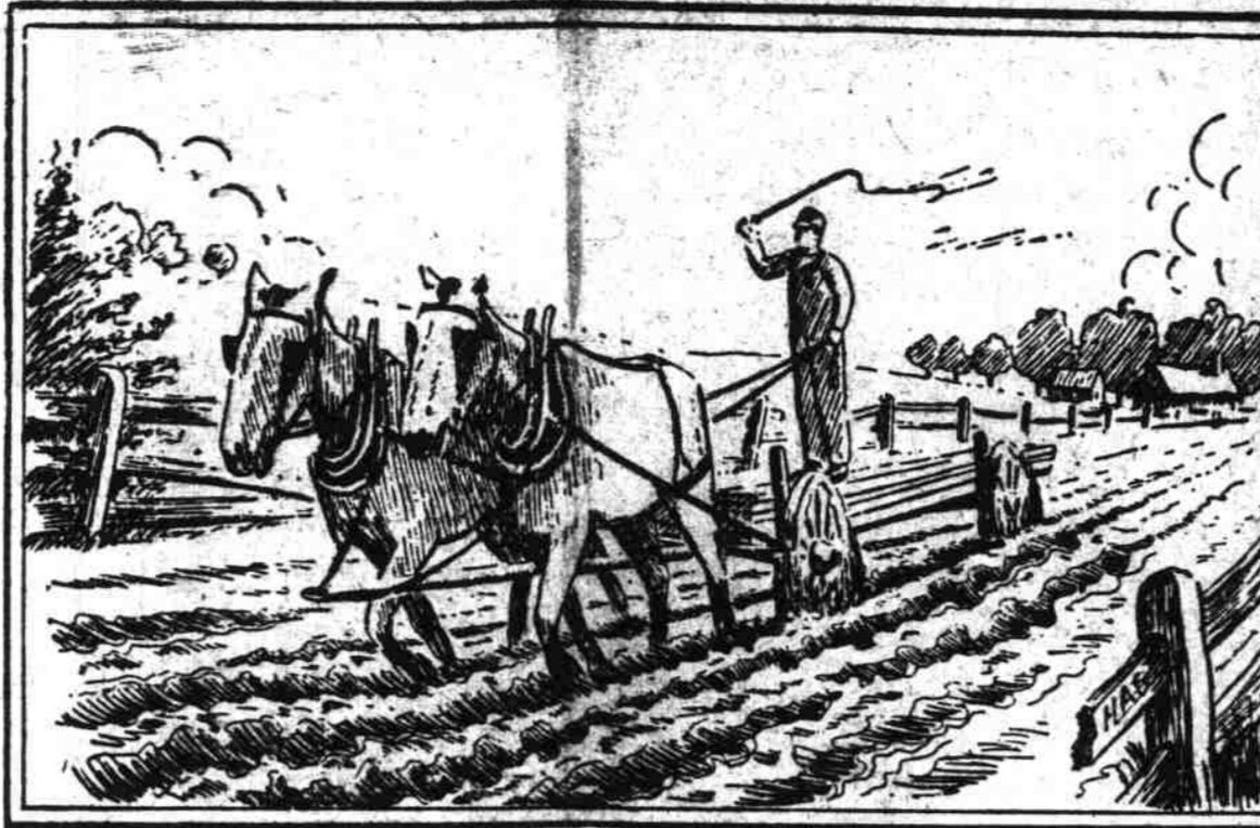
"I'LL BE BACK TONIGHT"