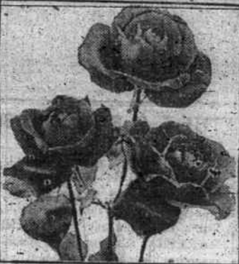
The Hybrid Tea Rose.

Advice as to the varieties of roses best suited to a particular region is best obtained from the nearest grower or nurseryman. A different type of rose is needed for each of the various purposes for which roses are used. Those which are suitable for lawns or borders will not give satisfactory cut flowers; special kinds are best for arbors or trellises and other ornamental purposes. In the opinion of the United States Department of Agriculture, roses are not very satisfactory for hedges, as most types are