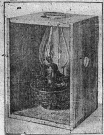
Making Use of Pasteboard Box.

Do you know how to tell the quality of an egg without breaking the shell? All you need is a pasteboard box with a hole 1 1/2 inches in diameter, a strong light such as is furnished by a lamp