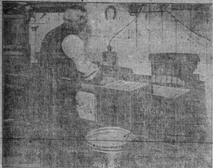
A Strong Light Renders Contents of Egg Visible and Its Quality is Indicated.

Do you know how to tell the quality of an egg without breaking the shell? All you need is a pasteboard box with a hole 1 1/2 inches in diameter, a strong light such as is furnished by a lamp