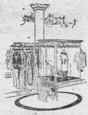
Shopping in the Women's Apparel Section is a revelation to the woman who has not visited them. The showings of new gowns, suits and wraps are simultaneous with smart Fifth Avenue presentations, and reflect the modes of both New York and Paris.