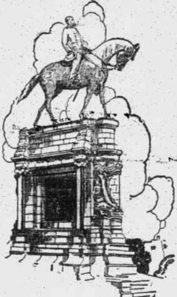
Mercie's statue of General Robert E. Lee on Monument Avenue. This statue of Virginia's most beloved son can be seen on the way from Broad Street Station to Miller & Rhoads Store.