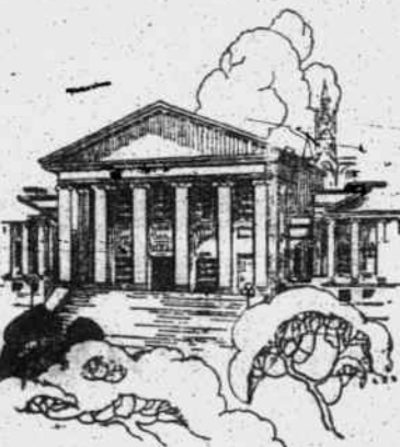
The State Capitol—a place dear to the hearts of southern people. It was designed by Thomas Jefferson, third President of our country, while that eminent statesman was minister to France. It served as the Capitol of the Confederacy from 1861 to 1865.

IT'S a delight just to walk through Miller & Rhoads Store in Richmond. It's a joy to the eyes just to see the beautiful array of merchandise gathered from every corner of the world. Like a great bazaar in its variety!