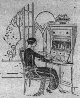
Making up a Christmas list is a delightful pastime for those who fill it with the pretty and useful things from Miller & Rhoads.