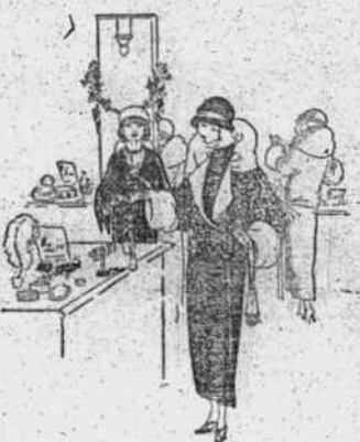
Shopping at our Christmas gift tables is the last word in convenience. Gifts are grouped according to price. All the gifts on one table are the same price.