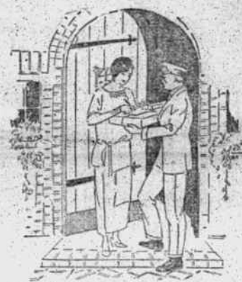
We pay the parcel post charges on all gifts sent directly from the store to out-of-town points. All gifts are carefully wrapped and insured against loss.