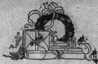
Suggestions for Christmas Gifts

If you are doing any of your Christmas shopping in Richmond, come in and see the new store with its magnificent Christmas display. A walk down the aisles will disclose hundreds of happy ideas for gifts, something to suit every conceivable taste and disposition. The aisles are wide and roomy; there is no crowding. You can make your selections in comfort without feeling rushed. If you are puzzled about what to buy for mother, father, husband, wife, brother, sister or friend; ask our salespeople. They could make a thousand sensible suggestions.