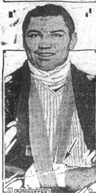
A passing speedster side-swiped Jack Dempsey's sedan—putting his car in the ditch and the champion in the hospital with a busted right arm. The boxing world is now wondering if Jack's "breadwinner" will carry the same old wallop.