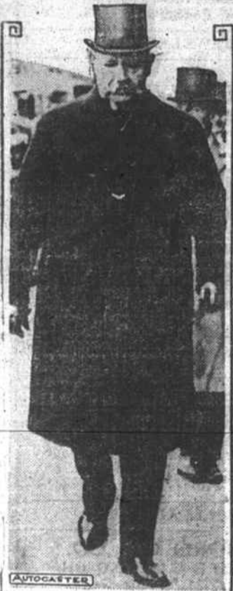
Exclusive new photograph of President Paul von Hindenburg, second president of Germany, taken immediately after he had taken the oath of office at Berlin.