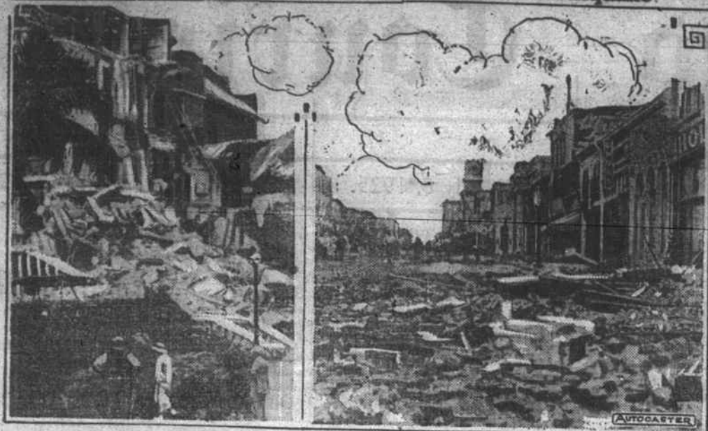
Here are two remarkable pictures, sent by telegraph, of the ruin in Santa Barbara, Calif., caused by the earthquake. At the left, the photo shows the ruins of the famous Arlington Hotel, almost completely wrecked. At the right—a view of State Street—principal business thoroughfare—as it looked one hour after the quake.