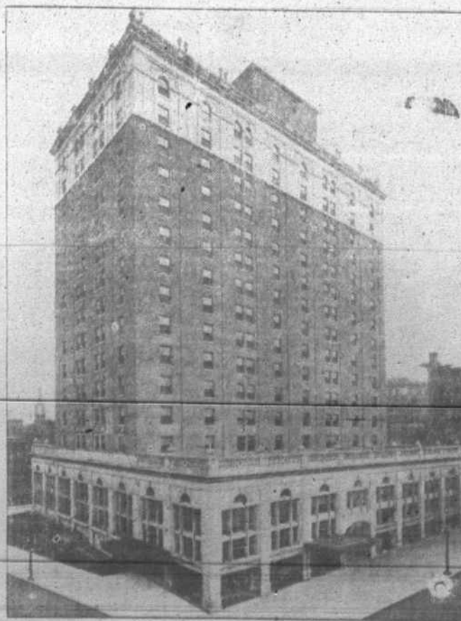
HOME OF THE WASHINGTON DUKE HOTEL DURHAM, N. C.

Being located in the center of the Piedmont Region of North Carolina, midway between the sea and mountains, with a network of paved roads in every direction. Easily accessible by bus and rail. Plenty of parking space for your car.