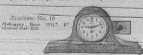
ELECTRIC No. 10 Mahogany Base 20 1/2" x 5" silver dial - $26.

Stop in and see these new clocks. They are fashioned with the same careful craftsmanship that has maintained the Seth Thomas reputation since 1813.