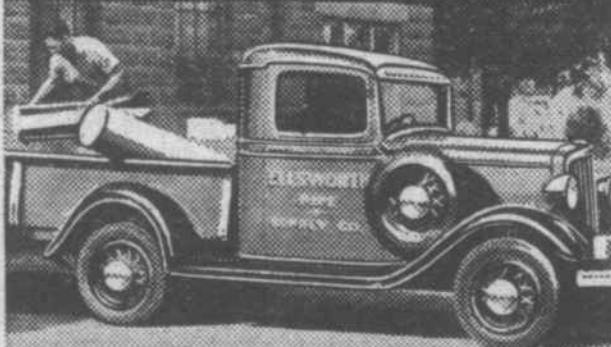
Half-Ton Pick-Up, $465 (112" Wheelbase)