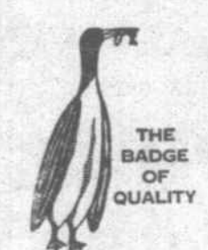
THE BADGE OF QUALITY Look For The Big Red Bird On Every Bag.

We have a stock of just the fertilizer you need - NACO Brand Peruvian Formulas for all crops. A real DEPENDABLE Guano.