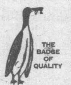
THE BADGE OF QUALITY Look For The Big Red Bird On Every Bag.

We have a stock of just the fertilizer you need - NACO Brand Peruvian Formulas for all crops. A real DEPENDABLE Guano.