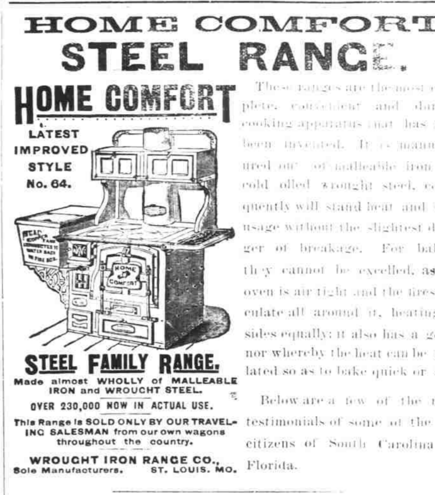
HOME COMFORT STEEL RANGE. LATEST IMPROVED STYLE NO. 64.