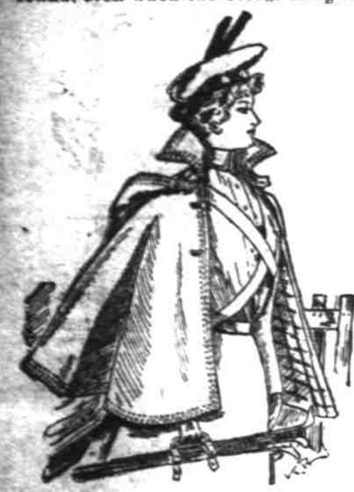
Designed by THE NATIONAL CLOAK CO. West 23rd St., New York.

[Our New York Letter. The latitude of New York does no: low in Fashion's train.