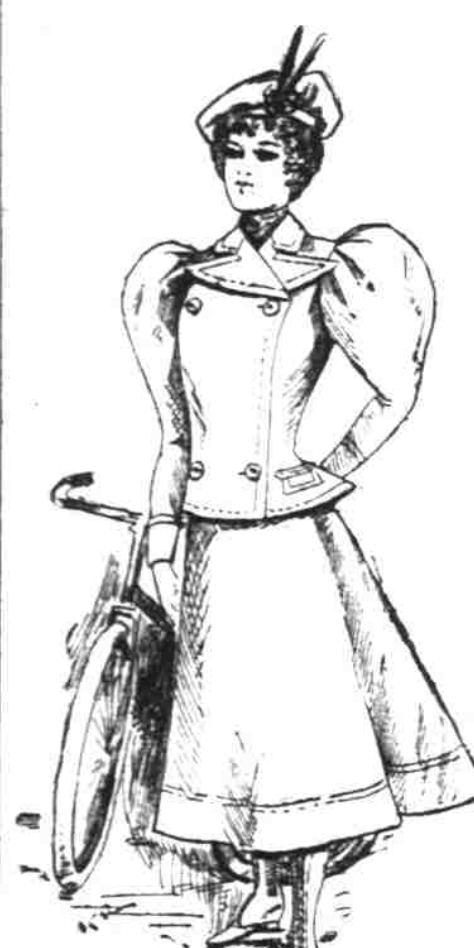
This is the costume she uses for Wheeling.

ten minutes. Besides all the dainty afternoon, trunks must contain, a bicycle suit will be almost indispensable. An outfit suitable for the wheel will also do service as a golf suit; it for boating. The combination of skirt and bloomers cannot blow Colf Cape with hood lined with plate about to all the four winds of