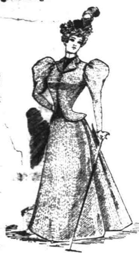
Traveling Dress of Mixed Cheviot. Designed by THE NATIONAL CLOCK CO. West 28d St., New York.

Of course, a vest, white col ar and a silk tie give a touch of smart ness, but a soft blouse certainly gives the greater amount of comfort