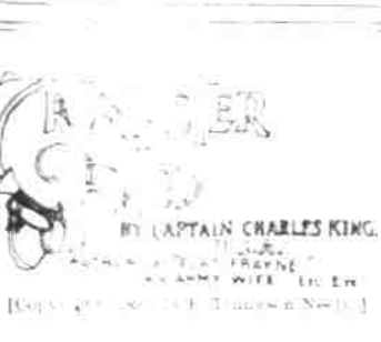
CAPTAIN CHARLES KING.

The world's commercial competition is being waged in every section of the world. It is a competition of the world's commercial competition, and it is being waged in every section of the world.