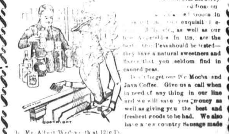
The - Ladies! Queen Quality