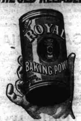
Absolutely Pure THERE IS NO SUBSTITUTE