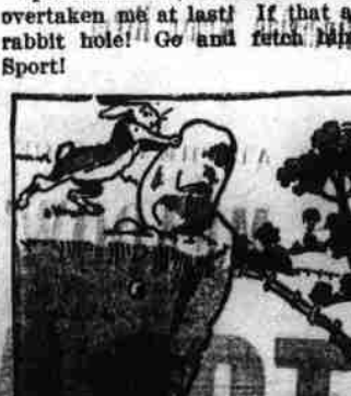
"It strikes me that dog's a long time. I'll just see what he's up to."

Sportsman—Ah, luck seems to have overtaken me at last! If that ain't a rabbit hole! Go and fetch him out, Sport!