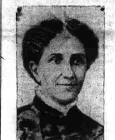
REV. MARY BAKER G. EDDY, Discoverer of Christian Science.