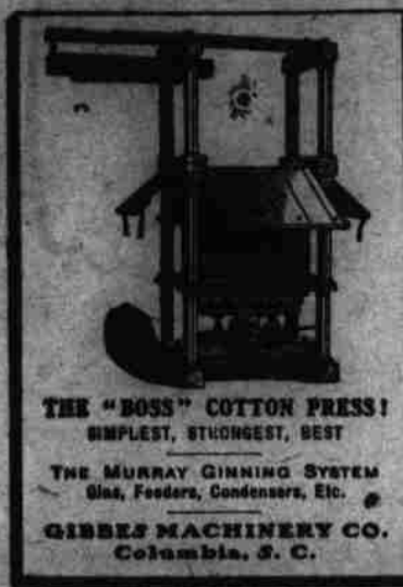
THE 'BOSS' COTTON PRESS! SIMPLEST, STRONGEST, BEST

THE MURRAY GINNING SYSTEM GIBBS MACHINERY CO. Columbia, S. C.