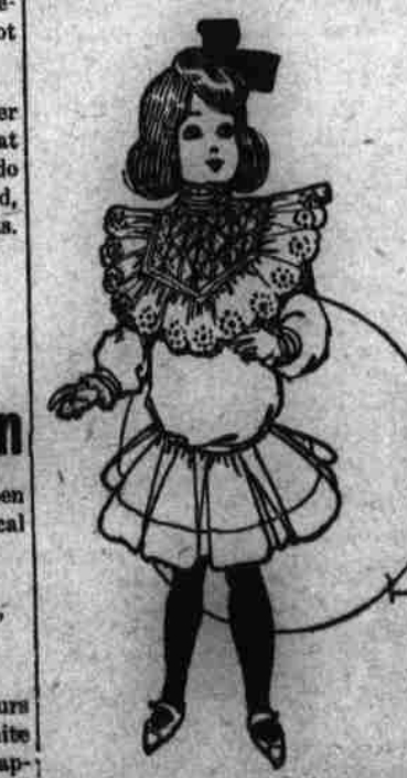
DRESS FOR LITTLE GIRL.

Long waited or French dresses are very generally becoming to little girls in addition to being in the height of style. This one is unusually attractive because of its big yoke collar, with wide frill, and is made of Persian lawn combined with embroidery, but it is suited to almost all childish materials. The yoke collar is a feature, and a most attractive one, but nevertheless is not obligatory, as it can be omitted and the plain yoke substituted. In the case of the lawn there is no body line.