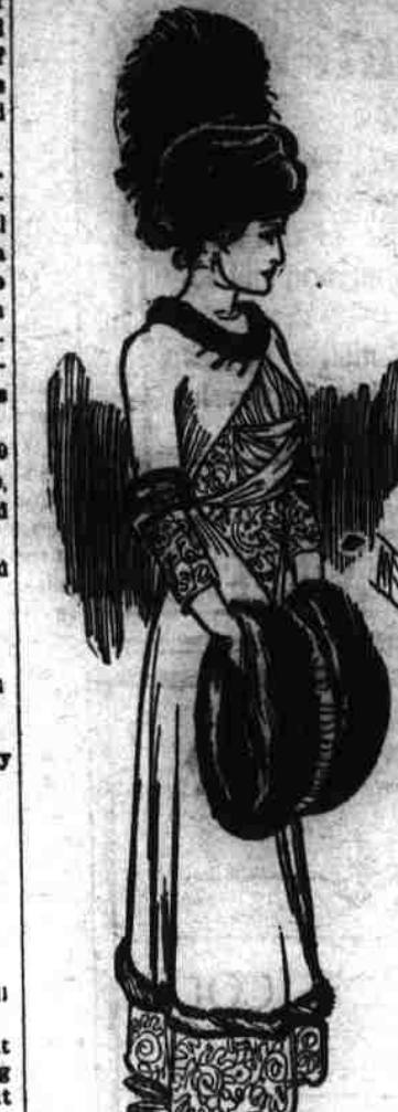
DARK GREEN GOWN TRIMMED WITH SKUNK. With it. The muff is made of shirred satin and fur in alternate bands, and the turban is of the same fur. The gown is of dark green cloth braided at the bottom of the skirt and in the pointed waist effect and the sleeves with self colored soutache. The waist is of plaited chiffon over Persian silk. For white or pale tinted gowns nothing is so well suited among the skins as sable or mink. Sable may be the royal vogue of that name or it may be one of the glossy soft skunkskins that imitate it closely in color. For gray or mauve nothing looks so well as chinchilla.

The excessive vogue of skunk has been a veritable boon for many persons who are obliged to consider the wearing qualities as well as the first cost of their furs. This fur is durable and stands exposure to weather as few other skins do. Some of the best stoles and muff sets are made of it, and it trims all sorts of gowns and coats. The suit in the drawing has a band of the skunk around the bottom of the tunic, and the neck and sleeves are finished