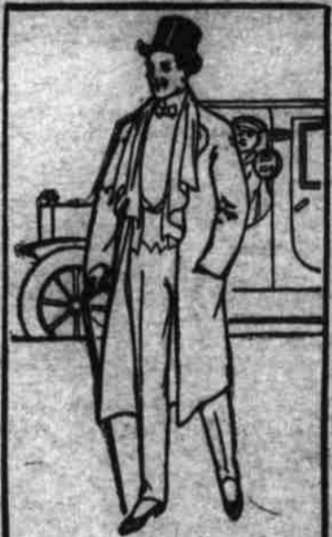
Hugo de Wattville, Man-about-Town

RUB-MY-TISM Will cure your Rheumatism Neuralgia, Headaches, Cramps, Colic, Sprains, Bruises, Cuts and Burns, Old Sores, Stings of Insects Etc. Antiseptic Anodyne, used internally and externally. Price 25c.