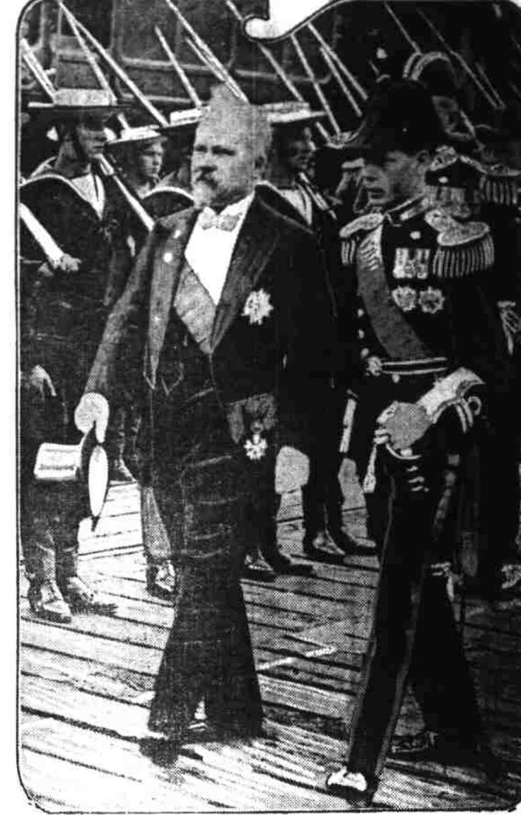
The future king of England, who has taken the field as a lieutenant, is shown here in company of President Poincaré of France.