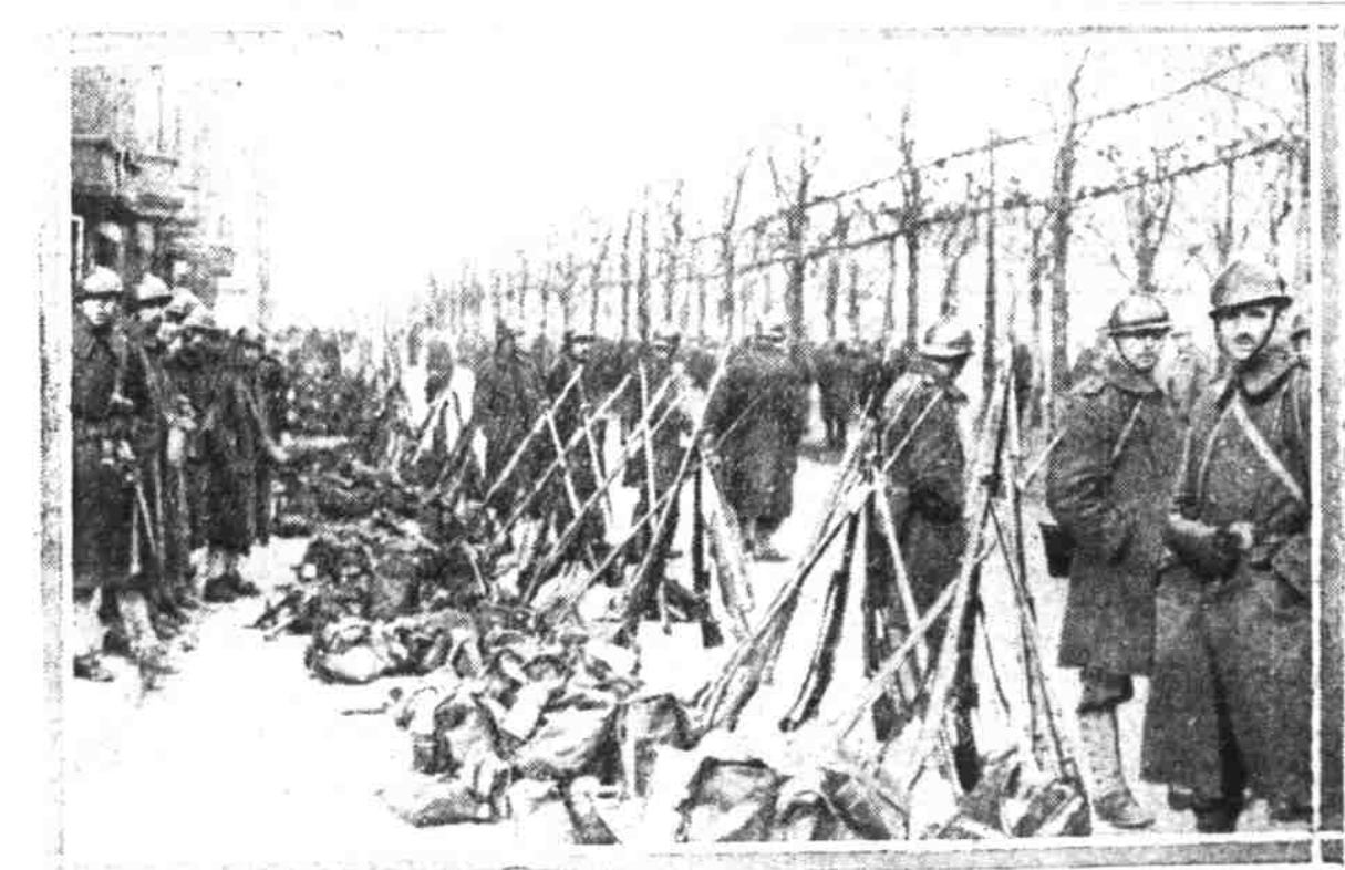
BELGIAN TROOPS IN DUSSELDORF:

This, one of the first photographs to arrive in the U. S. showing the new invasion of Germany, shows Belgian troops camped in the streets of Duesseldorf after their occupation of that important City.