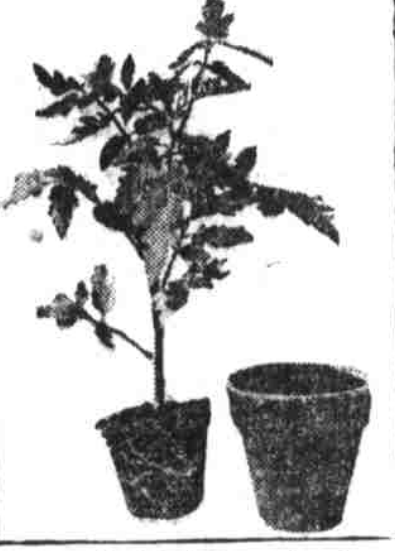
The Ideal Pot-Grown Plant.

Indoor Product, Carefully Transplanted to Different Sized Boxes, Profitable to Gardeners. The majority of home gardeners have a lobby on some sort of vegetable or on some certain kind of flowers. Tomatoes, being easy to grow, find popular favor with the small garden man.