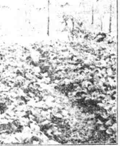
Strawberries, First Fruit of Season.

The radish patch usually is the first to be planted by the majority of home gardeners. The product in most instances is the first to grace the family table. The United States Department of Agriculture tells how: