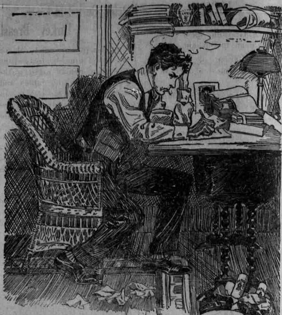
Writing to Her

The Michigan Glee Club has been asked to visit Japan at the expense of the Japanese government.