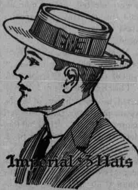
Imperial 15 Hats

Notion Novelties of all kinds. Invite the Student and Faculty trade to give us a trial. We are here to please YOU.