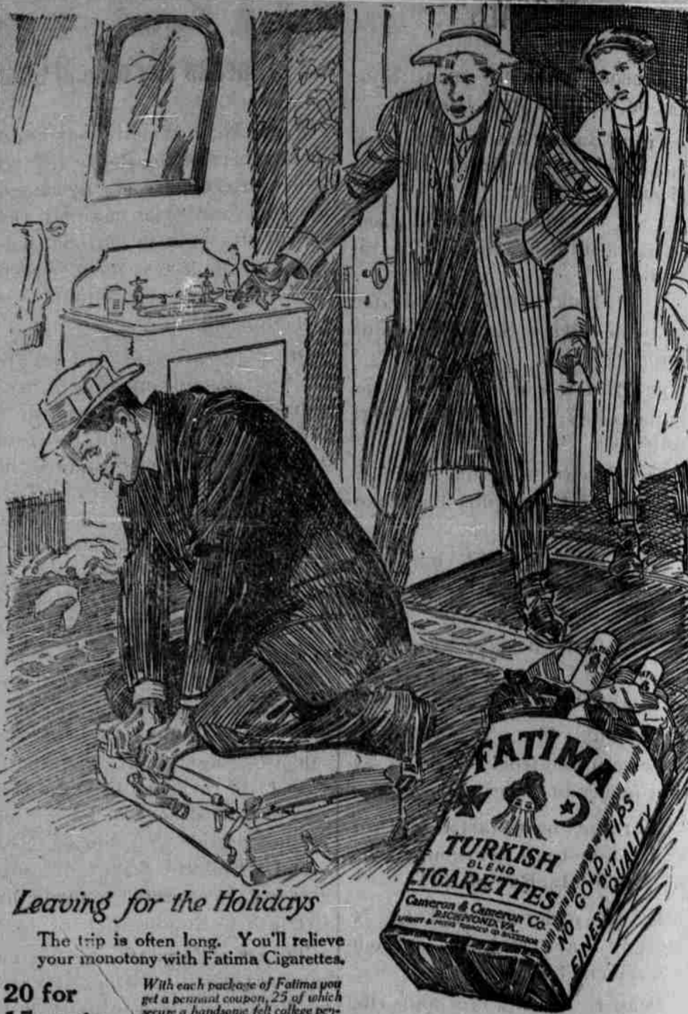
Leaving for the Holidays

The trip is often long. You'll relieve your monotony with Fatima Cigarettes. 20 for 15 cents With each package of Fatima you get a personal coupon, 25 of which secure a handsome felt college satchel (12x32)—selection of 100.