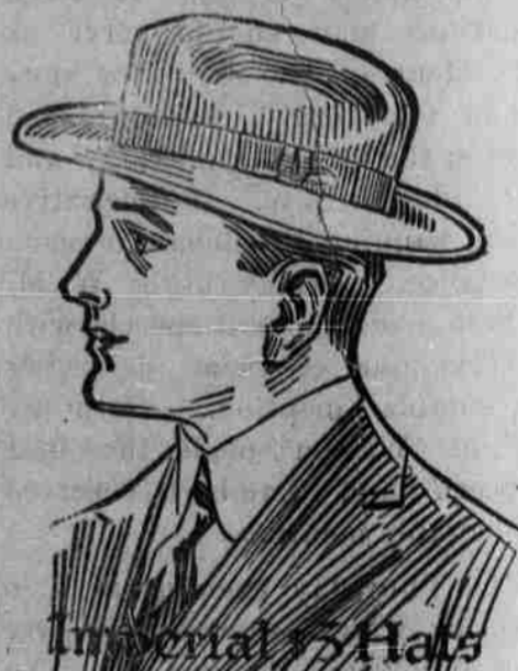
Imperial 15 Hats

Boys, they've come Get them now before your size has been sold.