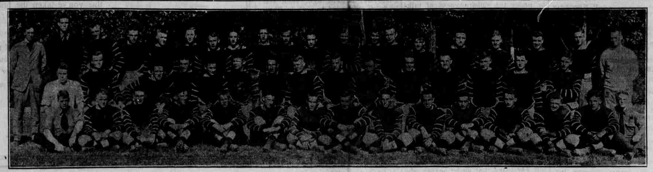
The University of North Carolina Football Squad