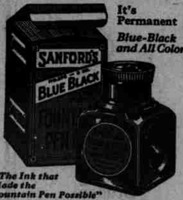
"The Ink that Made the Fountain Pen Possible"

When you write home for money, use SANFORD'S Fountain Pen Ink