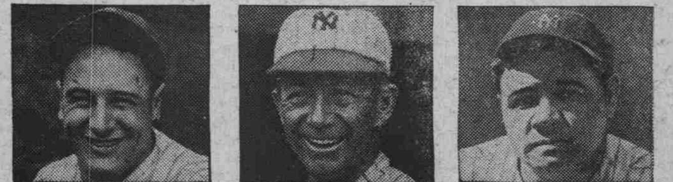
LOU GEHRIG (witness to the test)

© P. Lorillard Co., Est. 1760 Made from the heart-leaves of the tobacco plant