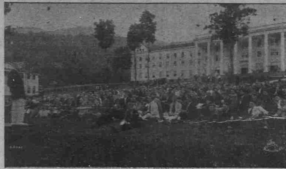
Typical evening audience comfortably reposed on the lawn in front of the Robert E. Lee. These groups frequently assemble to listen to addresses in the cool air while the sun is lowering behind the mountains.