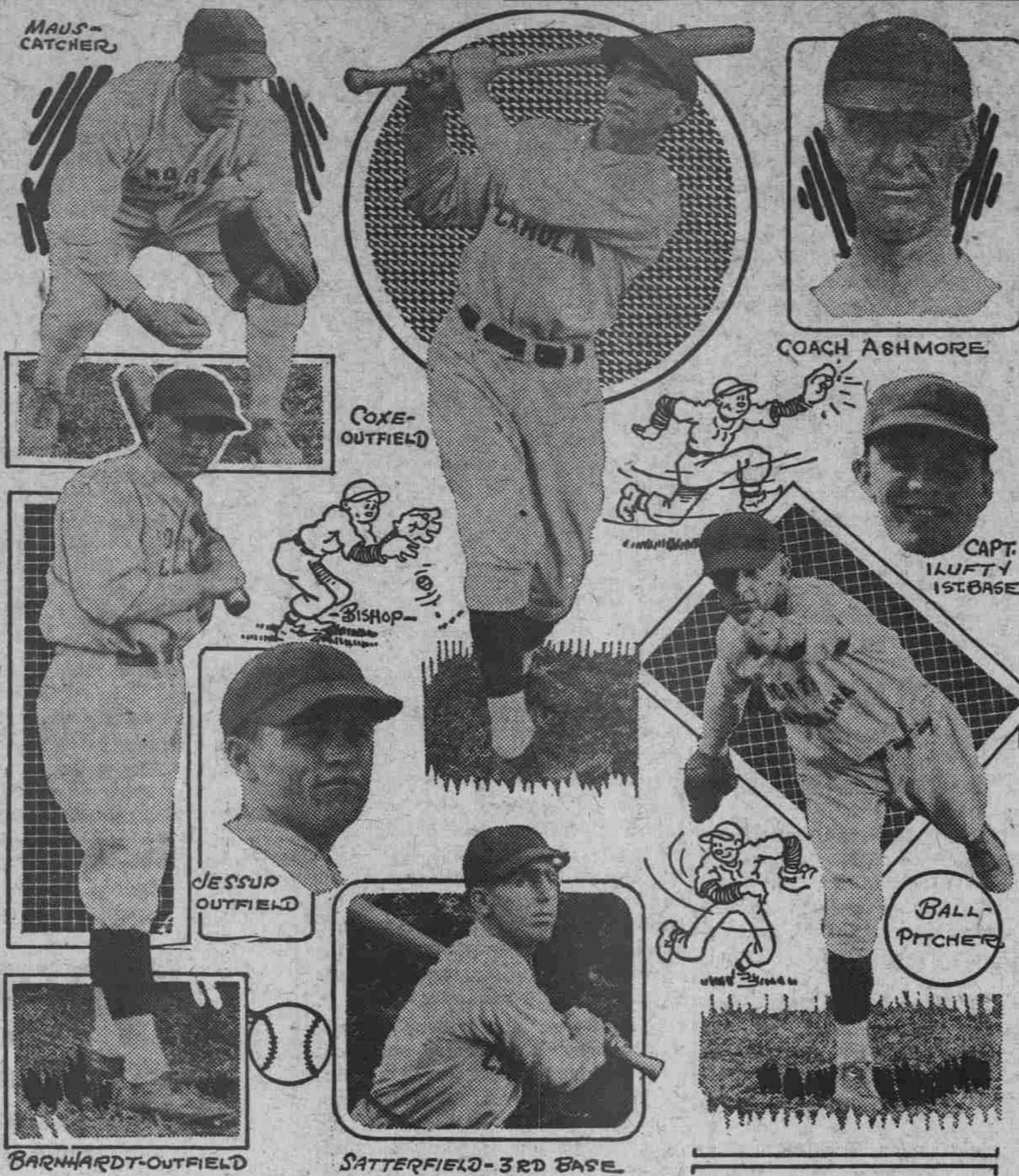
Pictured above are the veteran members of the University of North Carolina baseball team. The Tar Heels have already clinched the Southern Conference Tri-State League baseball title. They meet Virginia this week in two games that will decide the winner of the annual series between these two ancient rivals.

The first game with Virginia is to be played on Emerson Field tomorrow, and the second in Greensboro on Saturday. The game in Greensboro has come to be regarded as the outstanding college baseball classic of the South.