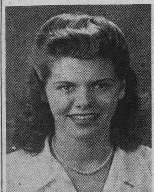
on the inside of the newspaper game, "Morning Edition."

There will be an all-important meeting of every member of the TAR HEEL staff Tuesday afternoon at 4 o'clock. This includes the news, editorial, advertising, business and sports staffs. This will be the first meeting under the new editorship and reorganization plans will be discussed. All persons not appearing will be dropped from the most head.