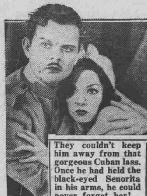
They couldn't keep him away from that gorgeous Cuban lass. Once he had held the black-eyed Senorita in his arms, he could never forget her!

Anyone interested in taking part in the tournament should see the manager of his dormitory or fraternity at once.