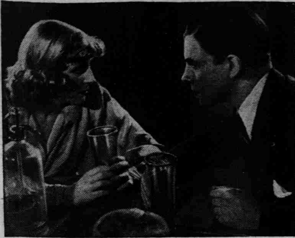
Gertrude Michael and George Murphy seem to have a great many things to say to each other, over the long, cool drinks they're holding, in Paramount's thrill-packed drama, "Woman Trap," which opens today at the Carolina Theatre.