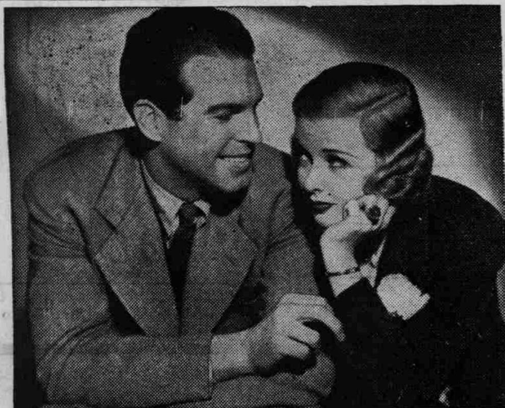
Fred MacMurray and Joan Bennett in one of the more peaceful moments in "Thirteen Hours By Air," thrilling, fast-moving drama of air-adventure now playing at the Carolina theatre. John Howard and Zazu Pitts head the supporting cast.