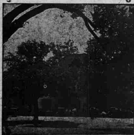
In the Y. M. C. A. Building

Owned and Operated by the University WELCOMES YOU